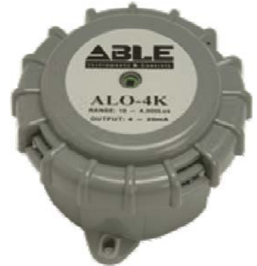
(Typical image for illustration purposes only)