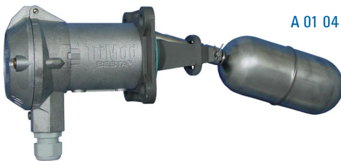
A 01 04

Typical applications: shipbuilding, refrigeration, chemical engineering, food industry, pulp and paper, drinking water supply, sewage treatment etc.